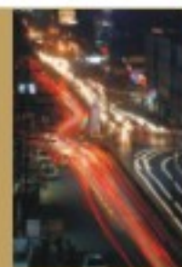
Jai Stambh Chowk