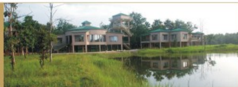
Eco Resort, Bamawapara