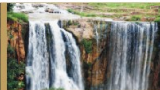
Chitrakot - Bastar